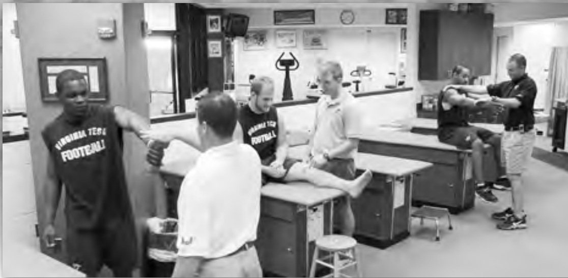
Tech's Eddie Ferrell Memorial Training Room and medical facilities are second to none.