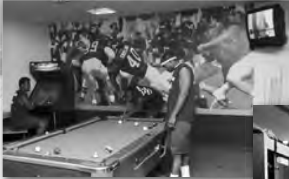
The Hokies enjoy a spacious and well-equipped locker room and adjacent players' lounge.