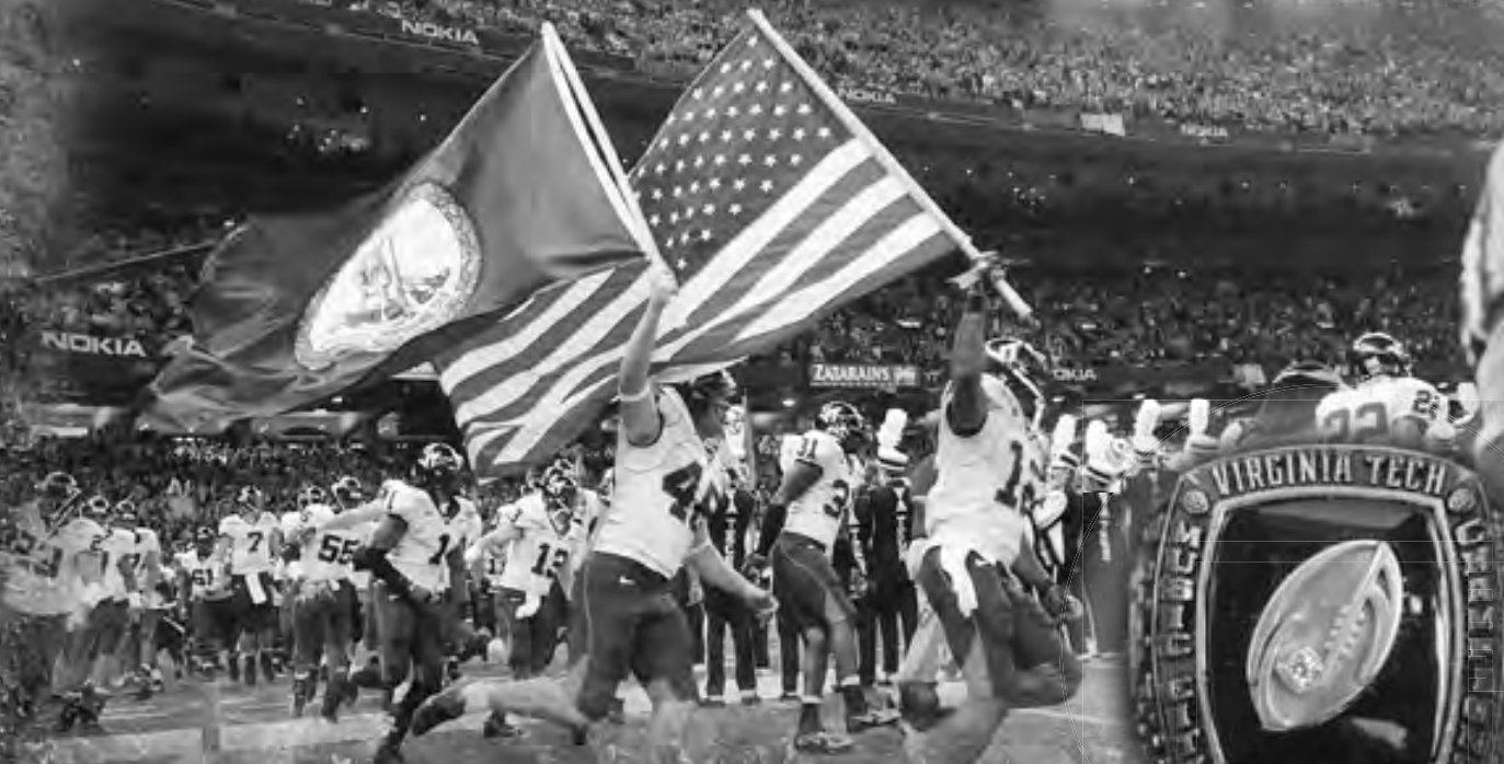
A Sugar Bowl berth was the reward for the 2004 Virginia Tech squad that went 10-3 and won the Atlantic Coast Conference football championship